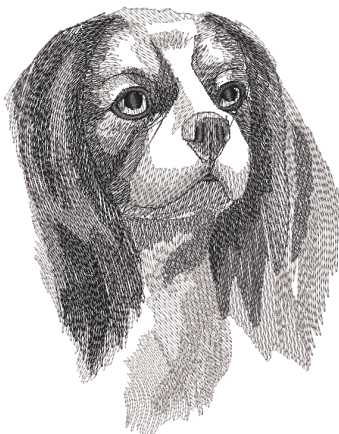
Center Front/Full Back Embroidery Not for Hats Approx. Size 5 1/2" X 4 1/2" Cavalier Head Sketch #LLE0525