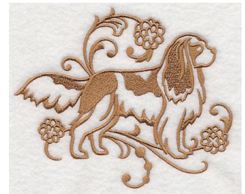
Center Front/Full Back Not for Hats Approx. Size 5 3/4" X 4 3/4" Graceful Cavalier King Charles # L6292