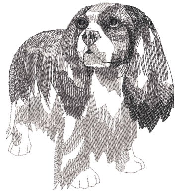
Center Front/Full Back Not for Hats Approx. Size 3 3/4" X 4 1/4" Cavalier Large Standing #LLE0524