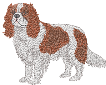
Center Front/Full Back Embroidery Not for Hats Approx. Size 3 3/4" X 3" Cavalier Profile #DG0919