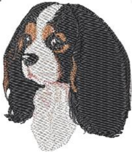
Left Chest Embroidery Not for Hats Approx. Size 4" X 3 1/2" Cavalier King Charles #BT3419