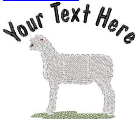
Left Chest Embroidery Approx. Size 4" X 3 1/2" Dorset #HR0531