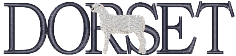
Center Front/Full Back Embroidery Approx. Size 10 1/2" X 2 1/2" Dorset Lettering #LLE3330